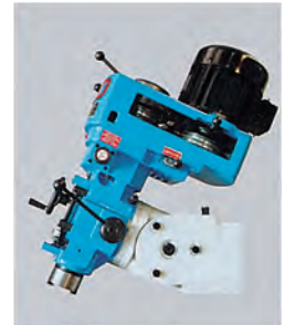
Inclination of head