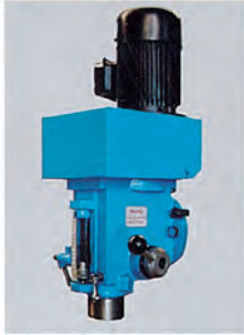
Gear head can be changed on