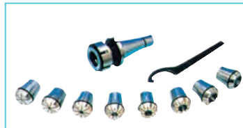
NT30, NT40 chuck and collets