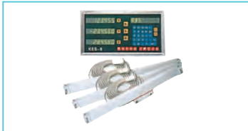
DRO ES-8 (950x400x400)