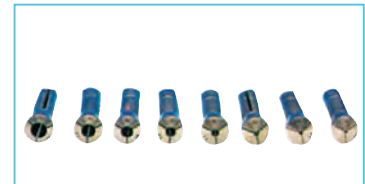
R8 Collet chuck