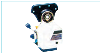
Power feed unit