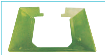
Oil collecting plate